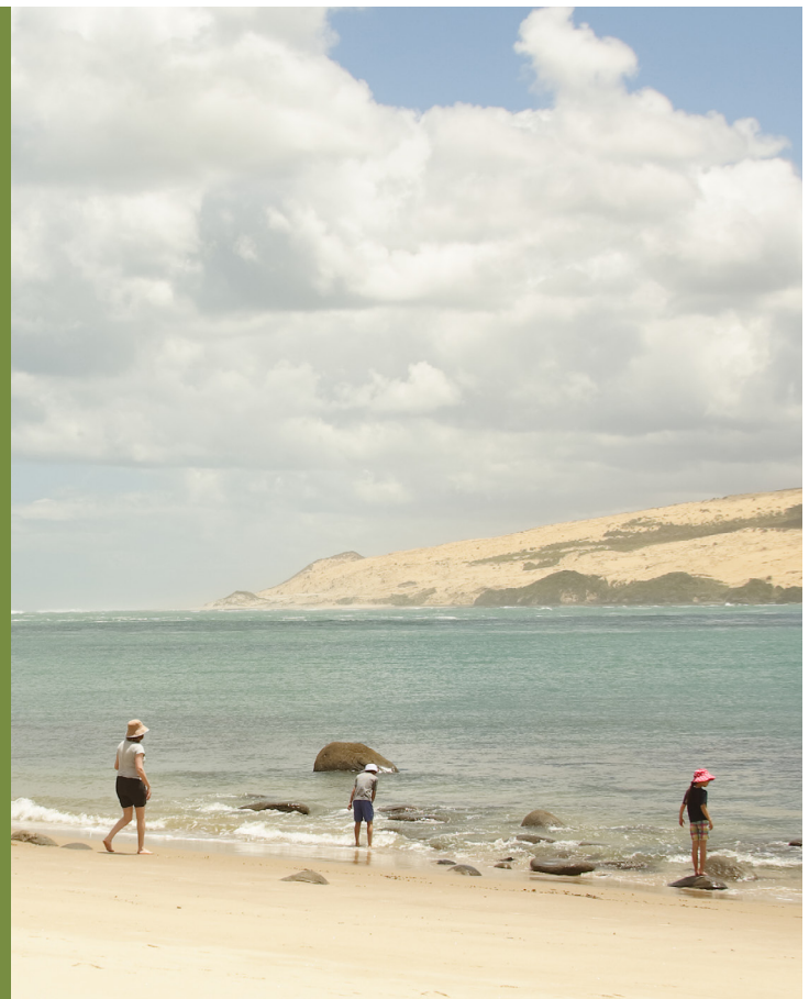
New Zealand's Living Standards Framework incorporates important well-being values in New Zealand, including enjoyment of a healthy natural environment and time with family.

The New Zealand Treasury uses its Living Standards Framework and Dashboard ( www.treasury.govt.nz/lstdashboard ), alongside existing economic and fiscal frameworks, to inform policy development and resource allocation across the government and work with the country's government ministries about how the policy decisions they make are likely to affect New Zealanders' living standards. This is a part of the New Zealand government's work towards its first well-being budget in 2019. Various ministries are beginning to use multidimensional well-being concepts and non-monetary cost and benefit analysis to assess needs and inform solutions. For example, the Ministry of Education has received funding to provide targeted support to 3- and 4-year-olds with oral language needs who are at risk for literacy difficulties; and the Ministry of Justice is aiming to reduce youth offending among high-risk 14- to 16-year-olds by providing cognitive behavioral therapy, functional family therapy, and professional youth mentoring services.