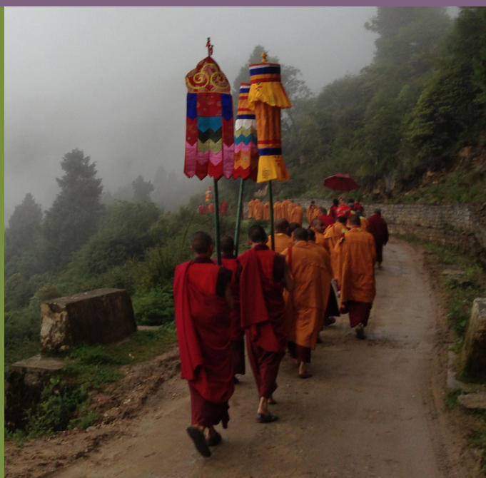
Bhutan’s Gross National Happiness draws inspiration from the Buddhist “middle path” of sustaining a balanced development that recognizes both the tangible and intangible aspects of well-being.

The concept of Gross National Happiness (GNH) was introduced in the 1970s by the Fourth King of Bhutan, Jigme Singye Wangchuck. Today, the country conducts a national assessment of well-being (as defined by nine GNH “domains”) and uses this data and framework to guide policy, planning, and resource allocation. Advanced from within the government (GNH Commission); the Center for Bhutan Studies ( www.grossnationalhappiness.com ); and from an NGO, the GNH Center Bhutan ( www.gnhcentrebhutan.org ); concepts of well-being are taking hold across key sectors, such as education, business, and government. Resulting policies, actions, and shifts in national narrative have resulted in innovative natural resource and tourism policies as well as Bhutan’s status as the world’s first carbon-negative country.