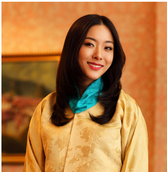
Her Royal Highness Gyalsem Kezang Choden Wangchuck, President

We must gently urge our Bhutanese citizens to raise a collective consciousness to embrace the Gross National Happiness point of view. Each of us bears the responsibility to carry on the pursuit of true happiness and goals inspired by the philosophy of GNH.